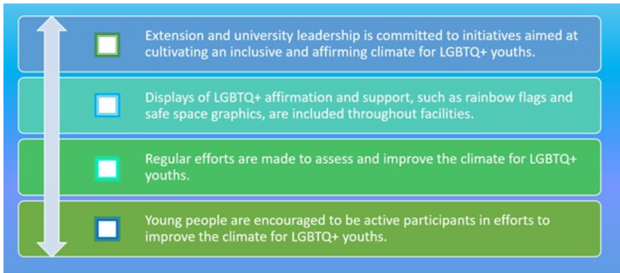
Figure 1. Systemic Advocacy