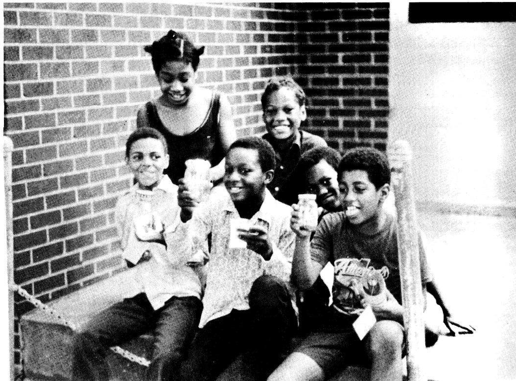
A group of cockroach trappers with their traps and prizes!

ing program on household clean-up and pest control or to generate an interest in such a program.